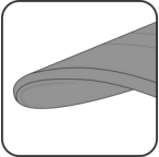
MID CURVE PEAK