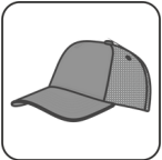
STANDARD 6 PANELS BASEBALL CAP