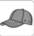
STANDARD 6 PANELS BASEBALL CAP