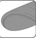
STANDART CURVE PEAK