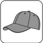
STANDARD 6 PANELS BASEBALL CAP